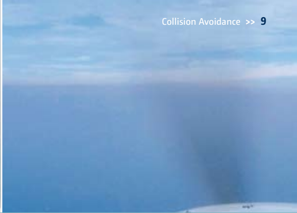
↑ OVERINVERSION (K)