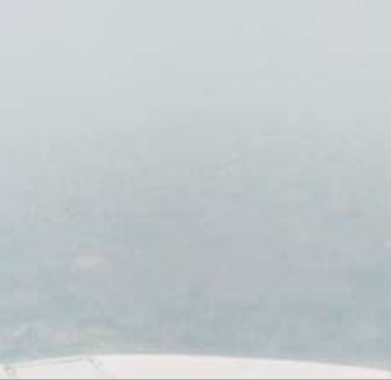
↑ HAZE (J)